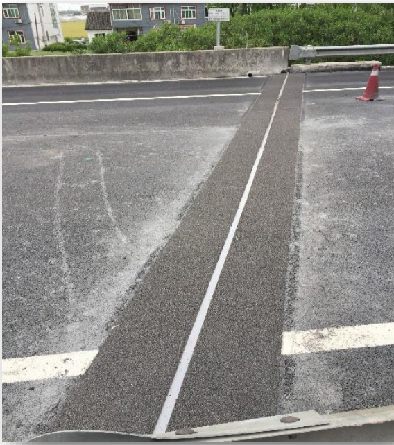
Polymer Concrete Nosing System CE 715 PNS Epoxy Repair Mortar