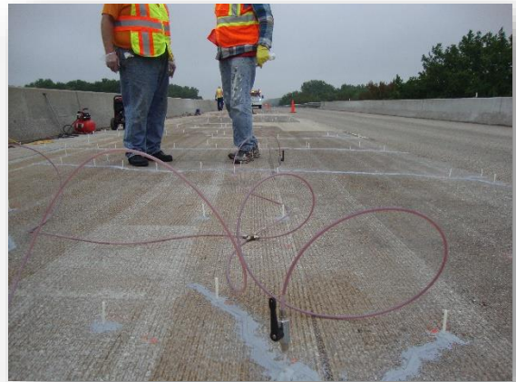
Low Viscosity Injection Resin CE 110 Construction Adhesive