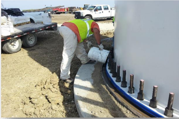
3 Component Structural Grouting System CE 815 Epoxy Grout