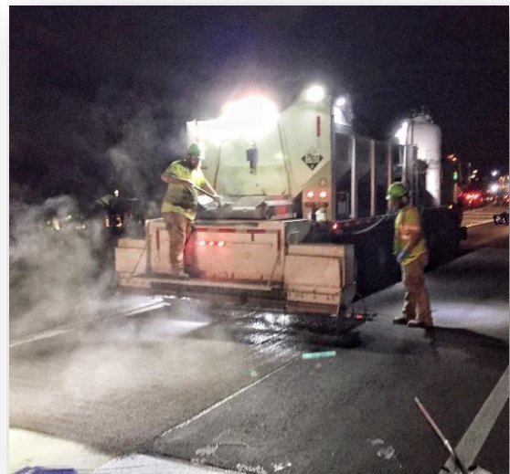
High Friction Surface Treatment CE 330 Epoxy Binder