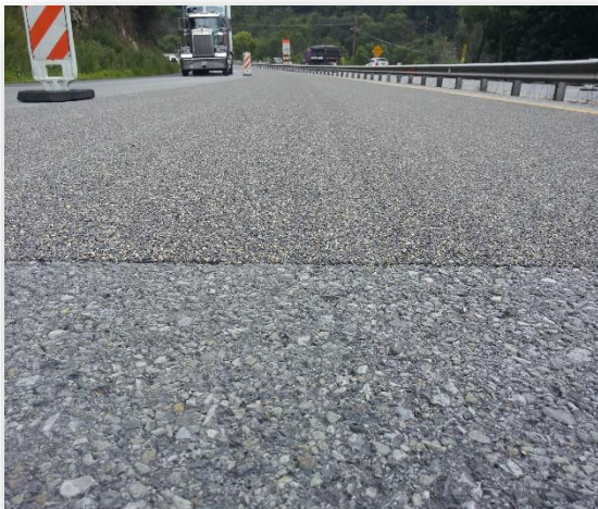
Bridge Deck Overlay Preservation CE 330 Epoxy Binder