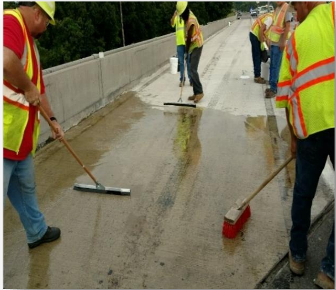
Low Viscosity Concrete Deck Crack Sealer CE 335 Epoxy Healer / Sealer