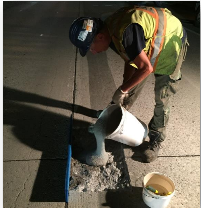
100 % Solids, 3 Component Epoxy System CE 710 Epoxy Repair Mortar